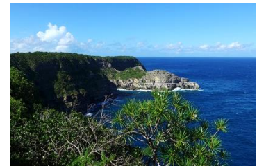
Grande Terre Guadeloupe

Cost TBA, from Miami. Includes 7 nights in Jamaica and in 6 nights in Guadeloupe.