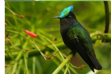
Antillean Crested Hummingbird