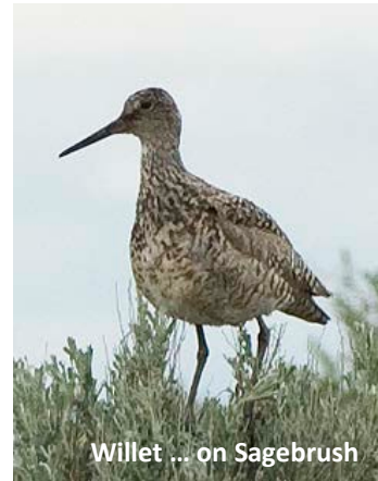
Willet ... on Sagebrush

Our daily birding at Malheur will involve a combination of foot- and car-birding. Because of the expansive nature of the region, some birding from the vehicle is unavoidable. However, we will travel in a large passenger van with a maximum of seven participants, giving each participant his or her own window in the van. Whenever we think it will be more productive, we will leave the vehicle behind. We will enjoy several short hikes, and we may frequently pop out of the vehicle to get good scope views of certain birds. The spring birding here is about both abundance and diversity, which makes the experience equally enjoyable for beginners and experts alike. As with most group birding tours, birders with more advanced skills may be able to find and identify more of the anticipated species, while less experienced birders can be guaranteed excellent looks at many potential “life-birds”. Your guides are patient, experienced educators, and we will work diligently to help each participant learn bird songs and visual identification, as well as general natural and cultural history of this fascinating region.