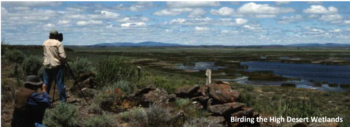
Birding the High Desert Wetlands