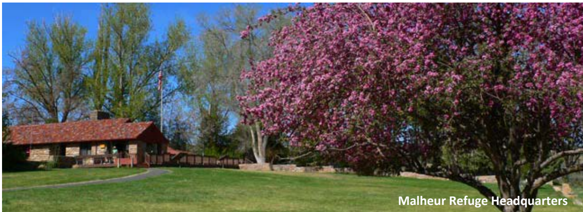
Malheur Refuge Headquarters

Our daily itinerary will depend on the movement of water through the Silvies flood plain and Blitzen Valley, as well as our success at finding certain species, but our general plan is fairly simple. We will meet at noon on Tuesday, May 15, in Bend, Oregon, and will head straight for Malheur, giving us plenty of afternoon and evening birding time in the Silvies flood plain before dinner. Wednesday will take us south through the Silvies flood plain to Malheur headquarters, sometimes a 2–3-hour trip, depending on the birds. We will explore the northern half of Malheur Refuge, as well as the Diamond Valley, before heading around the east side of Malheur Lake through “Raptor Alley” and across the northern shore of the lake before returning to town. On Thursday, we will explore the southern half of the refuge, from Krumbo Reservoir to Frenchglen, and out to Page Springs. Depending on snow levels on Steens Mountain, we may get a short distance up the western slope, or we may explore the desert habitats south of Frenchglen, followed by dinner at the Frenchglen Hotel. Friday morning will be reserved for another stop at Malheur headquarters before heading west through the Double “O” region and back to Highway 20.